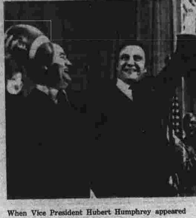
When Vice President Hubert H. Humphrey appeared at a high school political rally in Portland, Ore., Friday, he passed a football (left), part of a presentation; held up the hand of comedian Bill Dana (center); and gestured with his fist.